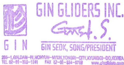
Gin Gliders Inc. (stamp)