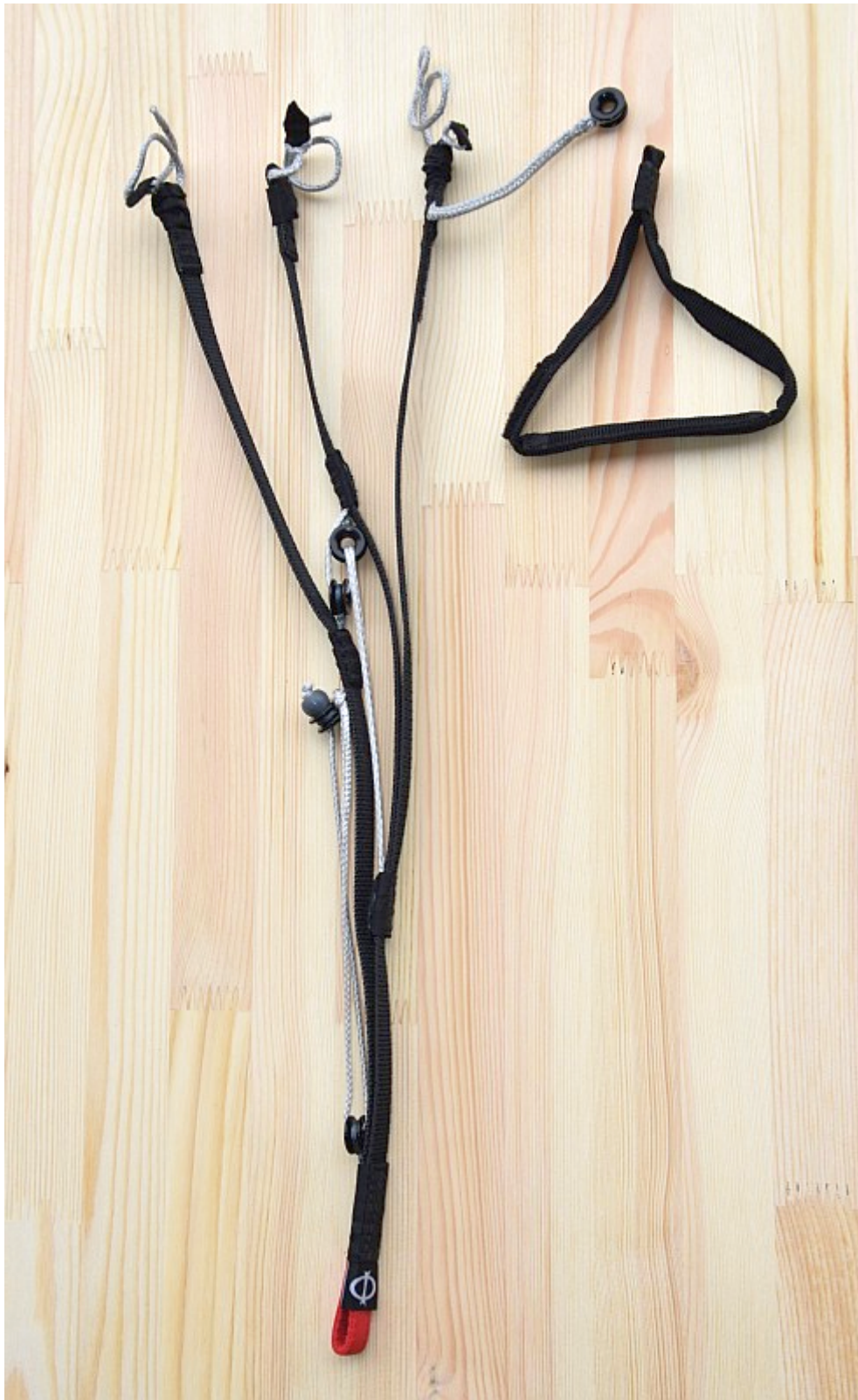
Superlight riser RZ3.

The mounting of the softlink riser / line connection is demanding! It should be done by an expert: service workshop or flying instructor.