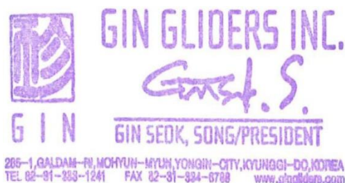
Gin Gliders Inc. (stamp)

285-1 GalDam-Ri, Mohyun-Myun, Cheoin-Gu, Yongin-city, Kyunggi-Do, Korea Zip Code : 449-851